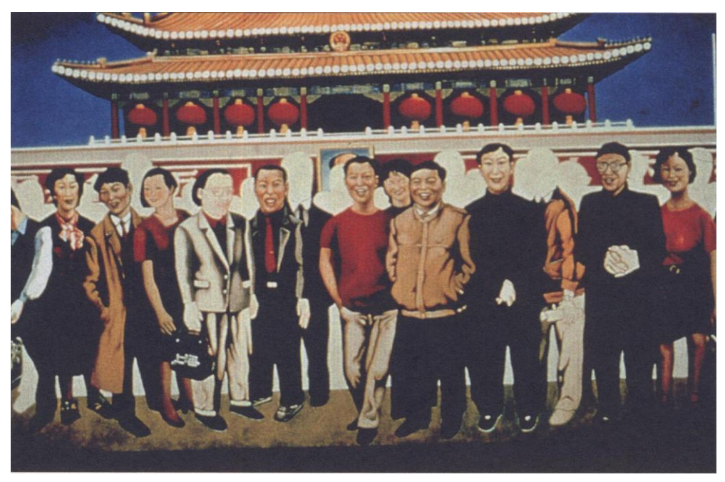
Figure 10: Wang Jinsong, Taking a Picture in Front of Tiananmen, 1990, oil on canvas, 125 x 185 cm. Courtesy of Hanart TZ Gallery

comic portrayal of The First Intellectual (2000)comments on the vulnerability and insecurity of the emerging generation of yuppies - a byproduct of China's social and economic reforms. Wang Xingwei's Again Not the Perfect Score explores the illogicality of the visual culture of today's well-to-do Chinese.