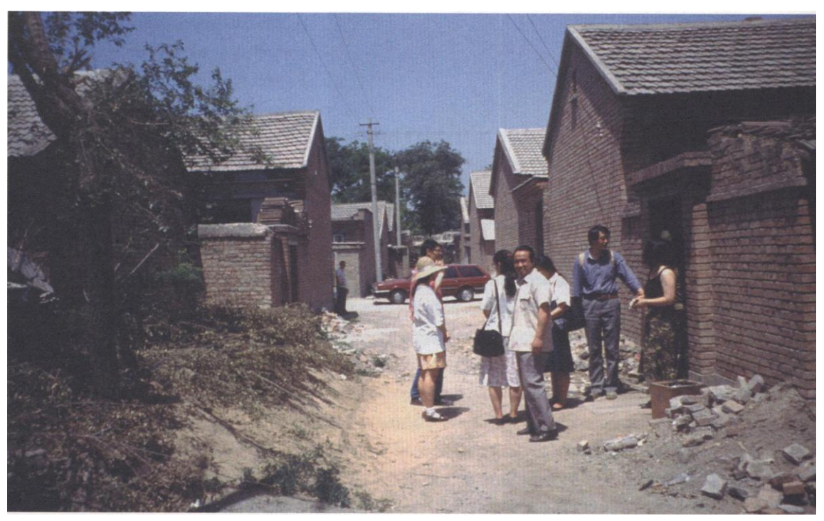
Figure 1: Artist Village in Yuanmingyuan.

Reinterpretation: A Decade of Experimental Chinese Art (1990-2000), the First Guangzhou Triennial organized by the Guangdong Art Museum, provides a comprehensive survey and attempts a systematic explanation of Chinese experimental art of the period. The three main themes of the exhibition are "Memory and Reality,' "Self and Environment," and "Global and Local." This essay discusses the first two themes, which together point to a new direction in Chinese experimental art of the 1990s - a "domestic turn" that transformed experimental art into a powerful vehicle of social critique. Before focusing on actual works of art, however, it is necessary to investigate the preconditions of this movement by looking at important changes in the lifestyle and social identity of experimental artists. These changes were crucial in that they encouraged social engagement and gave the artists a sense of independence - two factors indispensable to any kind of social criticism.