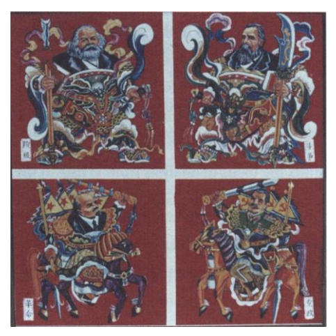
Figure 6: Liu Dahong, Door Guards, 1991, oil on cardboard, 40 x 40 cm.

memories of the Cultural Revolution (fig. 5). As I have discussed elsewhere, the Cultural Revolution continued to influence experimental artists.4 Some artists, such as Ye Yongqing and Zhou Tiehai, evoke the image of Big Character Posters to encapsulate that bygone era. Other artists, such as Liu Dahong (fig. 6) and Yangjiechang, resurrect communist heroes and heroines but turned them into characters of highly individualized narratives. Memories of the Cultural Revolution also inspired symbolic representations of political power, such as Mao Xuhui's Patriarch, Geng Jianyi's Hole, and Zhang Hongtu's Studs (fig. 7). The last work imitates the shiny red door of an imperial gate in the Forbidden City. According to the artist, this door is an important signifier in China because it simultaneously exhibits and conceals political power. Both functions enable those in power to control Chinese people. Essentially iconoclastic, Zhang Hongtu's gate mocks this