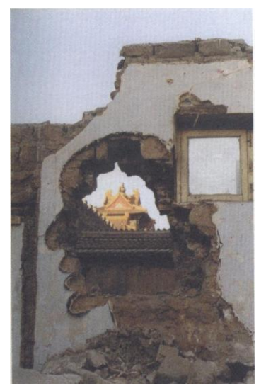
Figure 11. Zhang OaliDemolition, 8eijing, 1998

interact. The mass they form is a fragmentary one, without order, narrative, or a visual focus.