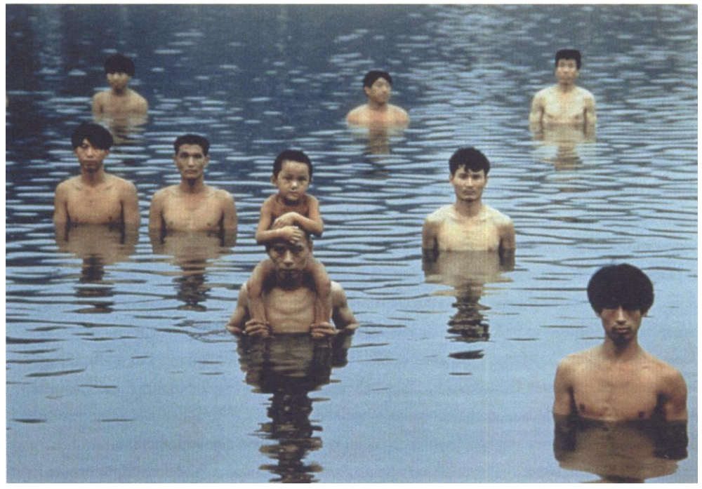
Figure 3: Zhang Huan, to Raise the Water Levelin a Fishpond.

There is one noticeable exception to this general situation. From 1992 to 1994, the so-called East Village (Dongcun) in Beijing became the base of a group of emigrant artists who worked closely together and initiated a new trend in experimental art. Unlike the communities at Yuanmingyuan and Songzhuang, the East Village artists developed a closer relationship with their environment - a polluted place filled with garbage and industrial waste - since moving there was considered to be an act of self-exile. Bitter and poor, these artists were attracted by the "hellish" qualities of the village that contrasted with the "heaven" of downtown Beijing. Inspired by this contrast, their works were energized by a kind of intensely repressed desire. The significance of the East Village community also lies in its formation of a close alliance of performing artists and photographers who served as both audience and critics to one another (fig. 3). This alliance later broke down