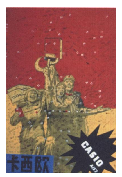
Figure 8: Wang Guangyi, Great Castigation Series: CASIO, 1990, oil on canvas

of women's liberation."5 Their strategy was to make their mothers the "artists" in the exhibition, while reducing their own role to that of an editor of readymade materials in the form of their mothers' private belongings and personal mementos. Compiled into chronological sequences and displayed in a public space, these fragmentary materials tell the lives of three Chinese women, unknown to most people beyond their families and work units.