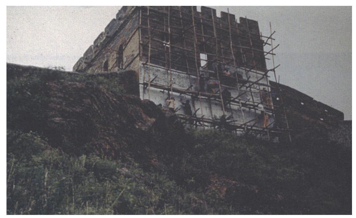
Figure 4: Xu Bing, Ghosts Pounding the Wall, 1990-91, rubbing on paper. Production view on the site of the Great Wall of Jinsbanling.

renew or revolutionize their programs, advising private companies and entrepreneurs to support experimental art, and organizing exhibitions in various kinds of non-exhibition spaces such as shopping malls, bars, abandoned factories, and the street. This last effort is especially significant in that it resulted in a series of experimental exhibitions aimed at inventing new forms, spaces, and modes of interaction with the public.