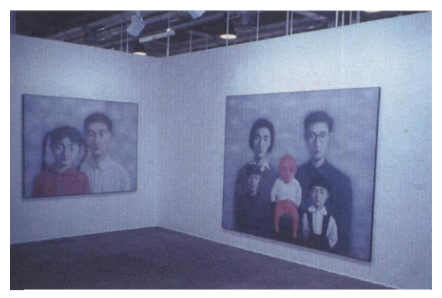
Figure 5: Installation view of Zheng Xiogang's paintings at the 2001 Art Basal.

enormous scale and stunning visual effect, his site-specific installation reinforces the glory and mythology of the Great Wall - which to Zheng continues to symbolize China and its future.