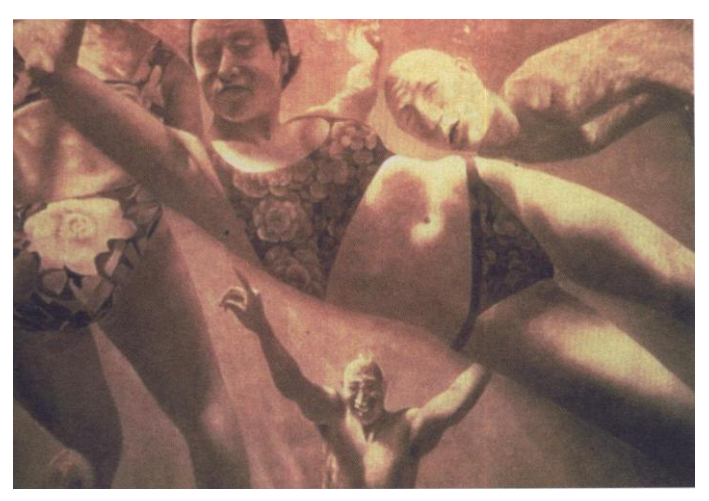
Figure 2: Fang kijun, Series 3, number 15,1993. Courtesy of the Tacoma Art Museum and the Henry Art Gallery

Many changes in the world of experimental art in the 1990s were related to this larger picture. Although a majority of experimental artists received formal education in art colleges and had little problem finding jobs in the official art system, many of them chose to become freelance "independent artists" (duli yishujia) with no institutional affiliation. There were, of course, artists who still wished and even struggled to maintain their jobs in public institutions but they were often forced to give up such options - as a result of their unorthodox artworks and approaches or their unconventional lifestyle and irregular travel schedule. To be "independent" also meant to become "professional" - a move that changed the career paths, social status, and self-perception of these artists. On the surface, freelance artists were free from institutional restrictions.